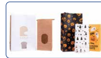
WINDOW AVAILABLE CLEAR WINDOW FILM