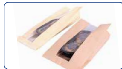
BREATH PERFORATION AVAILABLE

Pinch bottom bags are the essential packaging solution for bakeries, pastry shops, cafes and fast food restaurants. Our bags are made by state-of-art German machines with an output of 2,000 bags/minute, including with and without gusset are available. These bags are made with food-grade white paper and kraft paper which are recyclable and eco-friendly, and they are printed with non-toxic water-based ink to ensure the safety. We recently developed an innovative pinch bottom bag with perforation and sticker. When the food is packed in the bag, customers can enjoy the food by peeling the top half part of the bag.