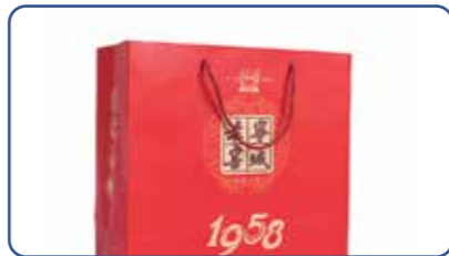
DIVERSE HANDLE ATTACH FINISHING AVAILABLE