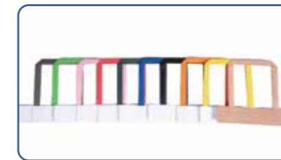
STANDARDS HANDLE COLORS AVAILABLE