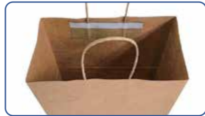
SELF-SEALING BAG IS ACCEPTABLE TO AVOID SCATTERED LOSS

Food delivery paper bags, we have many kinds of bag types for choosing. All bags making by fully automatic machines are with high efficiency and with stable assured quality. All bags manufactured by kraft paper are recyclable and can be reused and accord with environmental concept. All bags are printed using non-toxic food grade inks to ensure the product safety and improve the product performance.