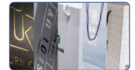
VARIOUS FINISHING AVAILABLE

Paper Flat Handle bags are manufactured by automatic machine and feature serrated top. The handles are on affixed on the inside of the bag and fold inside the bag, achieving a smaller shipping carton. Paper-Flat Handle bags are available in white or natural brown paper (virgin or recycled). All bags are recyclable, compostable and printed using non-toxic water-based inks.