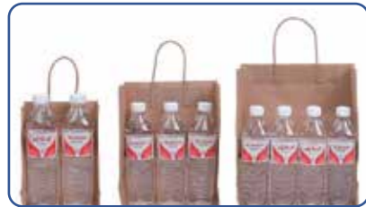
HIGH BAG STRENGTH