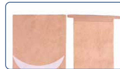
TIN-TIE AVAILABLE (Serrated Top/Tin-Tie Top)