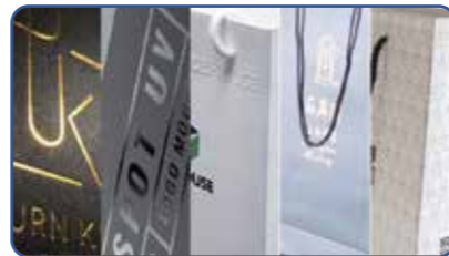
VARIOUS FINISHING AVAILABLE

Die Cut Paper Bags feature a cutout handle that is reinforced with film or cardstock. They are made by automatic machine and feature a serrated top. These bags are available in white or natural brown paper (virgin or recycled). All bags are recyclable, compostable and printed using non-toxic water-based inks.