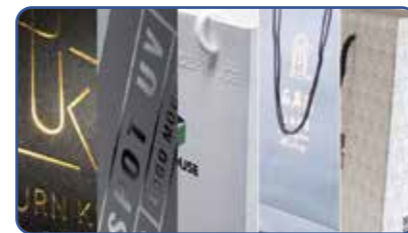
VARIOUS FINISHING AVAILABLE

These machine made bags offer exceptional value with competitive pricing and uncompromising quality. This is a great optiorto enhance your brand value while achieving low costs. Paper-Twist Handle bags are available in white or natural brown paper(virgin or recycled) All bags are recyclable, compostable and printed using non-toxic water-based inks.