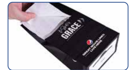
TWO LAYERS PAPER BAG

Self Open Style (SOS) bags provide a quick and easy packaging solution for quick service restaurants. Choosing the bags with window will facilitate the clients to see the products inside, and selecting the bag with Tin-tie top will keep the foods fresh. These bags are made with food-grade white paper and kraft paper which are recyclable and ecofriendly, and they are printed with non-toxic water-based ink to ensure the safety.