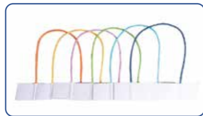
STANDARDS HANDLE COLORS AVAILABLE