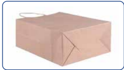
WIDE BOTTOM AVAILABLE