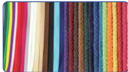
VARIOUS HANDLE ROPE AVAILABLE