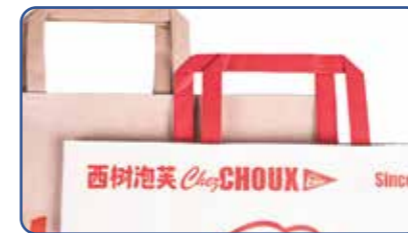
AUTOMATIC WITH STABLE HIGH QUALITY