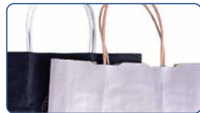
AUTOMATIC WITH STABLE HIGH QUALITY